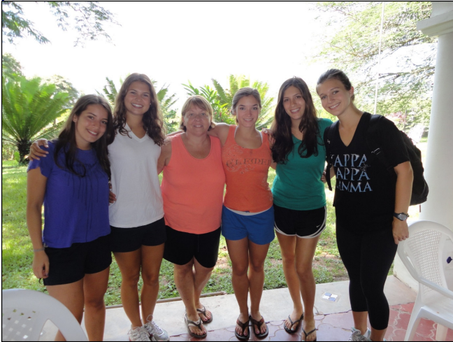
Upsilon Kappas on my trip to Honduras with the Northwestern University Medical Brigade: Still looking great after a week of hard work and cold showers!!!