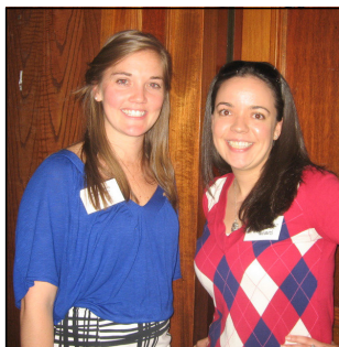
At the September Welcome Back Party at Lir

The traditions and foundations of the Fraternity are what make Kappa a unique organization. Themes of friendship, leadership and scholarship exist throughout our humble beginnings, a time in history when women were a rarity on college campuses. It is no wonder that KKG emanated from