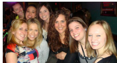
Some of the February Night Owls attendees